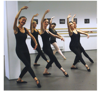
Dance - Ballet, Hip Hop, Street, Contemporary etc.